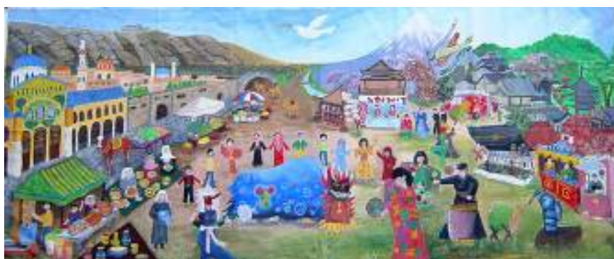
Figure 3 an example of International Exchange Learning among Japan and Syrian

Working with partner schools from abroad including exchange-learning using ICT, the pupils painted in cooperation. In this case No.13, the Japanese pupils and the Palestinian ones learned about the other culture from the other, using ICT such as internet videoconferences and a web BBS, before creating one mural in collaboration. The ICT connected the pupils from the opposite side of Asia and the pupils learned lots of things vividly from the other and could understand the very different culture and values. To make how deeply they understood visible, the Palestinians drew the Japanese world and the Japanese drew the Palestinian world, based on what they had learned from the other. This resulted into highly motivating the pupils to learn. Also it proved to be a very effective way to understand the other and to unite the two.