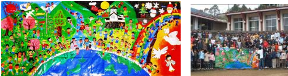
Figure 2 an example of Collaborating Work with Domestic Schools

Two or more domestic schools conducted exchange-learning using ICT and painting in cooperation. Children from No. 8 two elementary schools in the same city worked together. They made an Art Mile Committee consisting of several pupils from both schools. The members regularly had meetings to decide a theme, make a schedule, bring each school's ideas about the theme and get them together, draw a rough sketch out of every class's idea. Then all the pupils camped together for painting, and finally a colorful, dreamful and peaceful mural was born (Figure 2). They wish for Peaceful Asian World like their hometown.