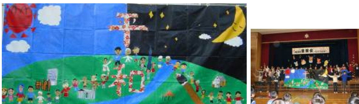
Figure 1 an example of Single-handed Work

SH: Single Handed CD: Collaborate with Domestic schools CO: Collaborate with Overseas schools